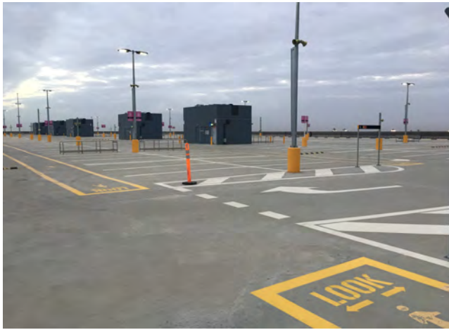
Post Tension Exposed Concrete Deck