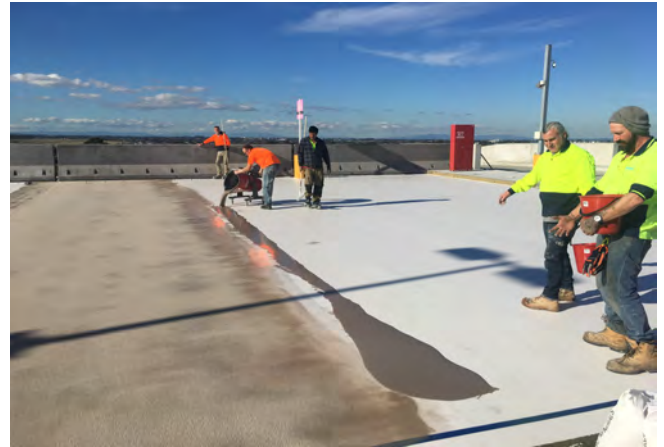
Wearing Layer Installation