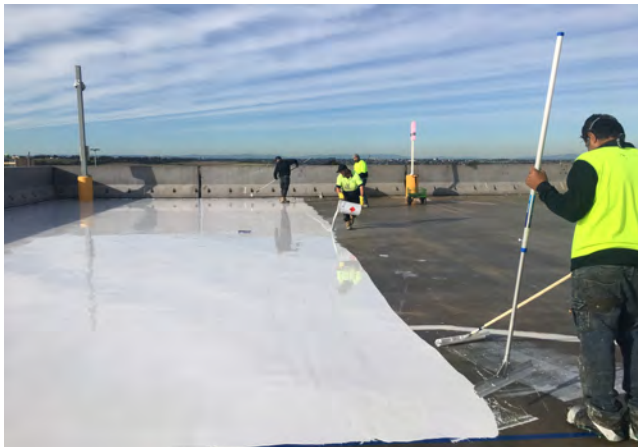
Application of Waterproofing Layer