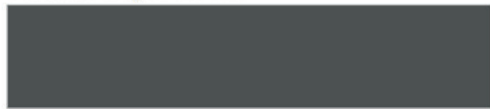
Traffic Grey B RAL 7043