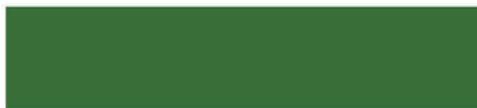
Grass Green RAL 6010