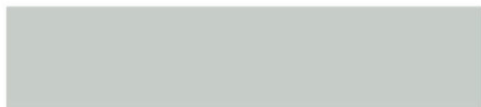
Light Grey RAL 7035