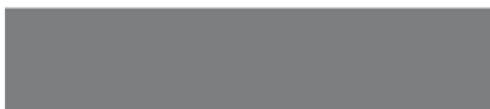
Dusty Grey RAL 7037